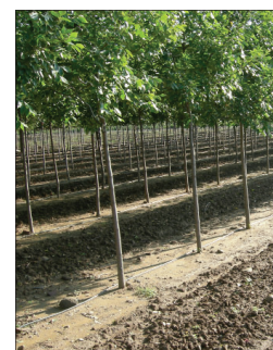
PE Tubing with On-Line Drippers in Nursery