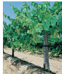
PE Tubing with On-Line Drippers in Vineyard