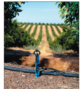
PE Tubing with SuperNet Sprinkler in Orchard