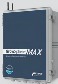
GrowSphere™ MAX without screen