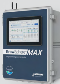
GrowSphere™ MAX with screen