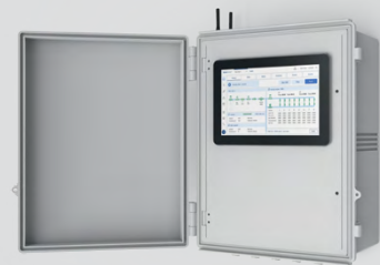
GrowSphere™ MAX double door with screen