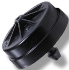
PRESSURE COMPENSATING (PC) NON CNL

MAINTAINS A UNIFORM FLOW RATE WITH THE WIDEST COMPENSATION RANGE - 7 TO 58 psi