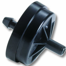
WOODPECKER PRESSURE COMPENSATING (WPC) NON CNL