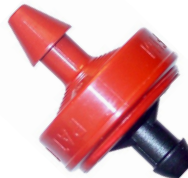
WOODPECKER PRESSURE COMPENSATING JUNIOR (WPCJ) WITH CNL