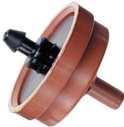
WOODPECKER PRESSURE COMPENSATING (WPC) WITH CNL