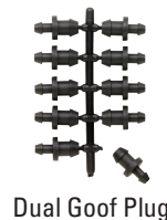
Dual Goof Plug